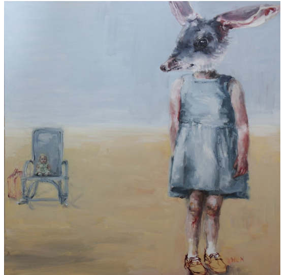
Bilby, bilbi, still waiting, 2017, oil on canvas, 76 x 76 cm