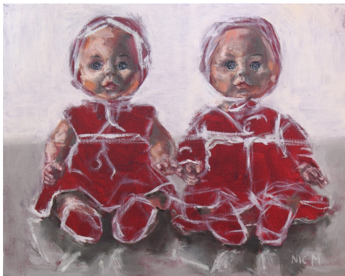
Two dolls, 2017, oil on linen, 40 x 50 cm

When I arrive, Nic Mason is at home with her kids, and there is a contented flurry of work in progress. Nic shows me a series of sculptures that will feature in her latest exhibition, Still. There are a dozen or so round vessels lined up on the large kitchen table. They are translucent, delicate, and fragile. Yet they resemble something robust and utile - a vehicle for food, a bowl to eat from, a feeling of being nurtured. The bowls are inspired by gumnuts and eucalyptus leaves that are observed in abundance around the property during daily walks with her Kelpie, Nim.