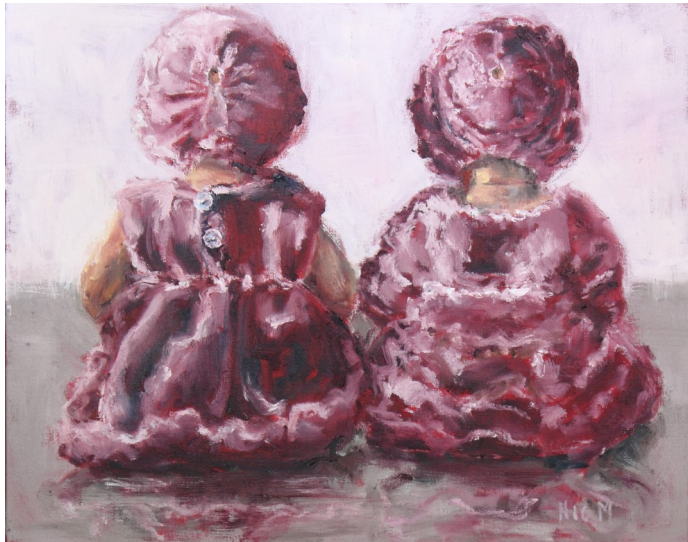
Back of two dolls, 2017, oil on linen, 40 x 50 cm

It is blisteringly hot on the drive out to Napoleon Reef, situated on the outskirts of Bathurst. With the car windows down the air is dry, carrying with it the scent of eucalyptus, and dry grass. The parched landscape has a hazy, sun-bleached appearance. The light lends itself to a palette of dusk rose, pewter blue, and creamy terracotta.