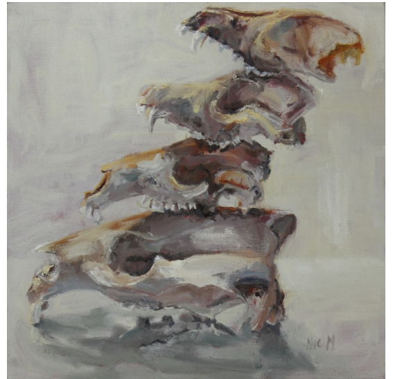
Fox, fox, red-necked wallaby and wombat, 2017, oil on canvas, 40 x 40 cm