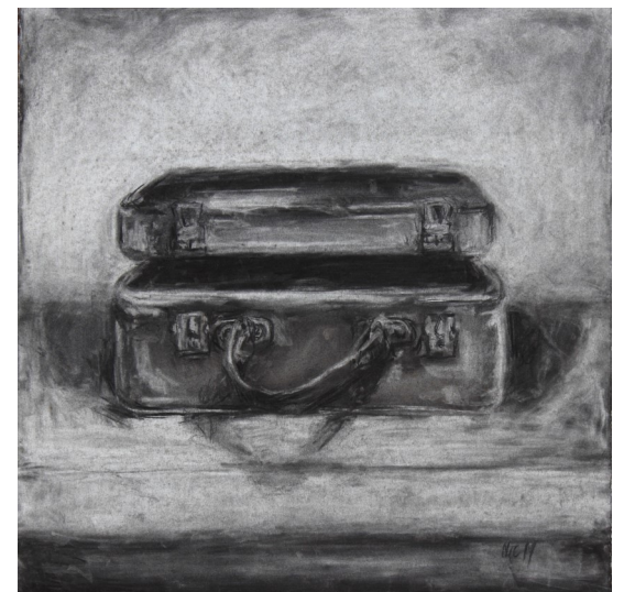
Red bag, charcoal on paper, 2017, 56.5 x 56.5 cm (unframed)