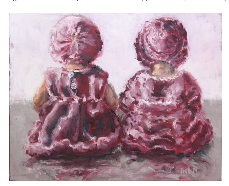
Back of two dolls, 2017, oil on linen, 40 x 50 cm

It is blisteringly hot on the drive out to Napoleon Reef, situated on the outskirts of Bathurst. With the car windows down the air is dry, carrying with it the scent of eucalyptus, and dry grass. The parched landscape has a hazy, sun-bleached appearance. The light lends itself to a palette of dusk rose, pewter blue, and creamy terracotta.