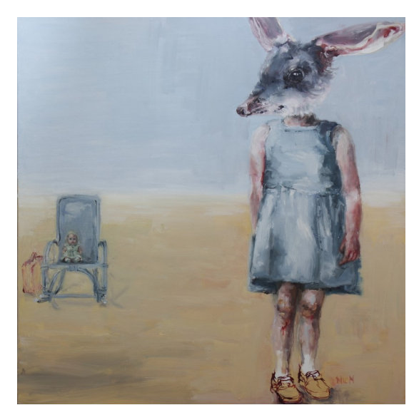
Bilby, bilbi, still waiting, 2017, oil on canvas, 76 x 76 cm