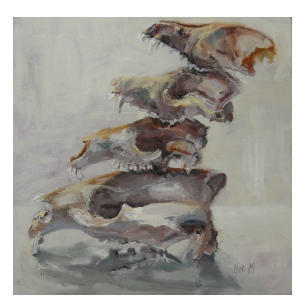
Fox, fox, red-necked wallaby and wombat, 2017, oil on canvas, 40 x 40 cm

New growth, branch II, 2017 paper mâché, wire