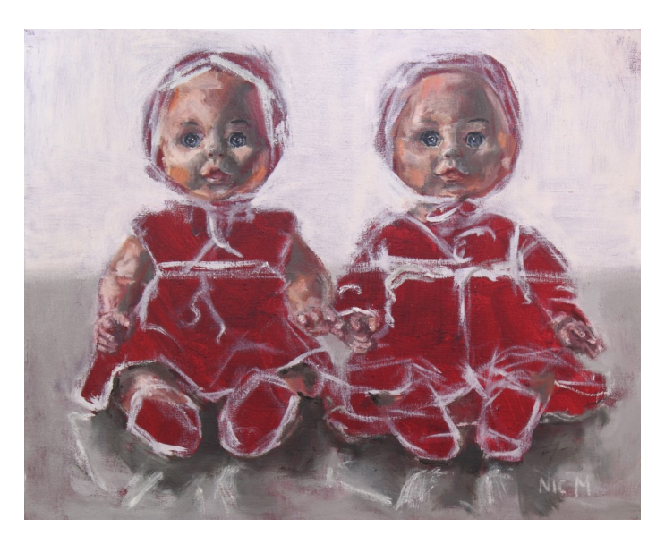
Two dolls, 2017, oil on linen, 40 x 50 cm

When I arrive, Nic Mason is at home with her kids, and there is a contented flurry of work in progress. Nic shows me a series of sculptures that will feature in her latest exhibition, Still. There are a dozen or so round vessels lined up on the large kitchen table. They are translucent, delicate, and fragile. Yet they resemble something robust and utile a vehicle for food, a bowl to eat from, a feeling of being nurtured. The bowls are inspired by gumnuts and eucalyptus leaves that are observed in abundance around the property during daily walks with her Kelpie, Nim.